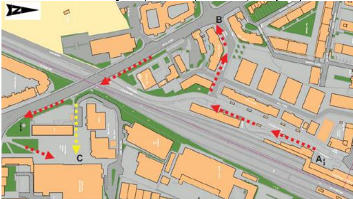
Plan 1 – current walking route (shown in red) or via stairs (shown yellow)